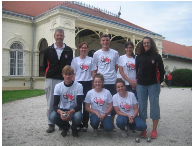
Eng 1 v Eng 2